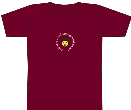
Fine Jersey Oral Sex Women