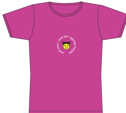
Baby Rib Oral Sex Women