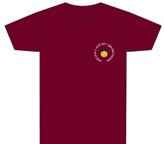
Fine Jersey Oral Sex Unisex

Cranberry, S M L XL (XXL available for add'l charge)