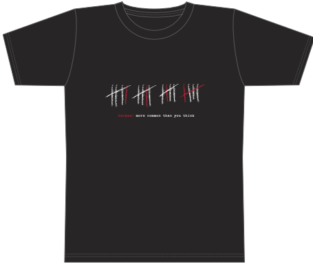
Fine Jersey Tally Women