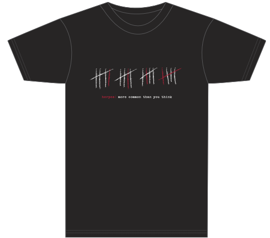
Fine Jersey Tally Unisex

Black, S M L XL (XXL available for add'l charge)